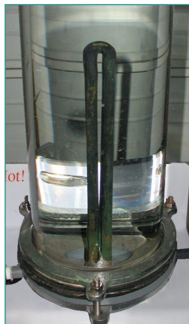
Treated No scale with treatment