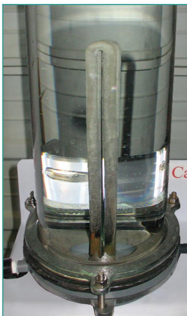
Untreated Scale build-up in untreated water