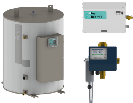
Accessories & Tanks DigiTemp® Jr., Bolt®, Bolt® Mini