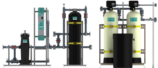
WQ Series Water Quality Systems