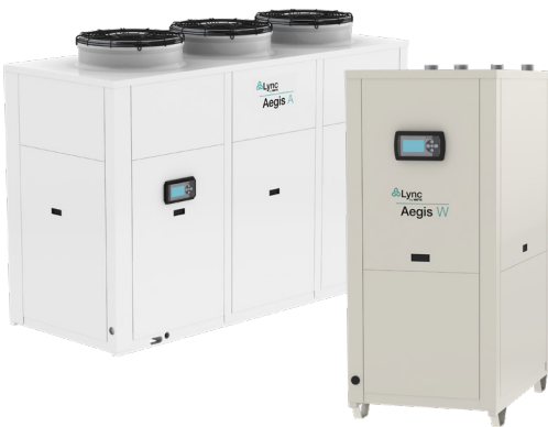
Aegis® CO 2 Heat Pump Water Heaters