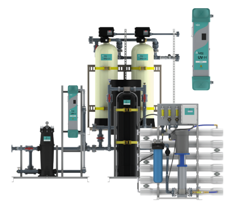
WQ Series Water Quality Systems