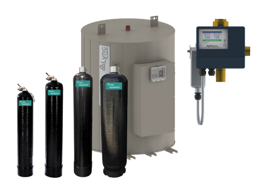
Accessories & Tanks AquaSolve, DigiTemp Jr., Bolt