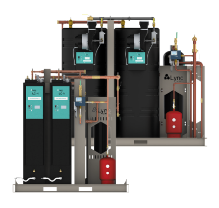
LC Series Water Heating Systems