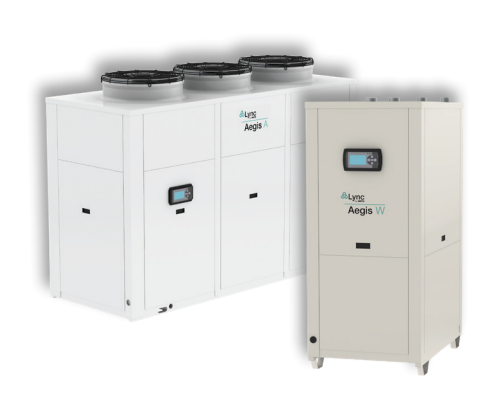
Aegis® CO<sub>2</sub> Heat Pump Water Heaters