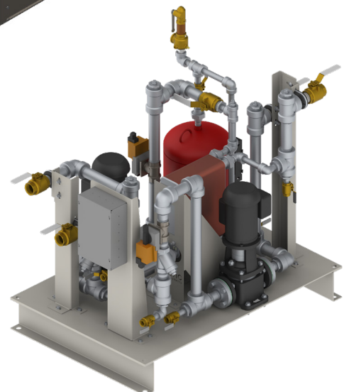
Mark II Single 300 psi Version